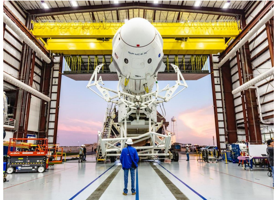
A SpaceX Falcon 9 rocket rolls out of NASA Kennedy Space Center's Launch Complex 39A on Jan. 3, 2019. The rocket will undergo checkouts prior to the liftoff of Demo-1, the inaugural flight of one of the spacecraft designed to take NASA astronauts to and from the International Space Station.

David Oberhettinger, Jet Propulsion Laboratory