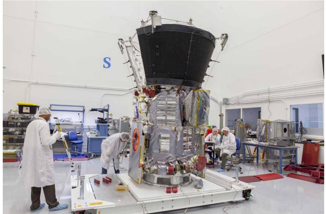
NASA's Parker Solar Probe has completed its first orbit of the Sun and has now begun the second of 24 planned orbits, on track for its second perihelion, or closest approach to the Sun, on April 4, 2019.