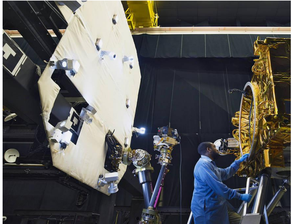
At NASA's Goddard Space Flight Center, a 10 by 16-foot robot tests satellite servicing capabilities on Earth before they're put to use in space. Sitting on top of the six-legged hexapod is a partial mock-up of a satellite.