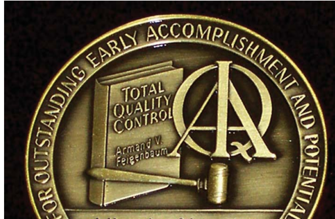
Back of Medal, includes name of Medalist