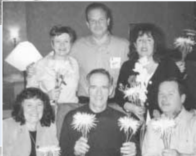
▲ The Wild Bunch