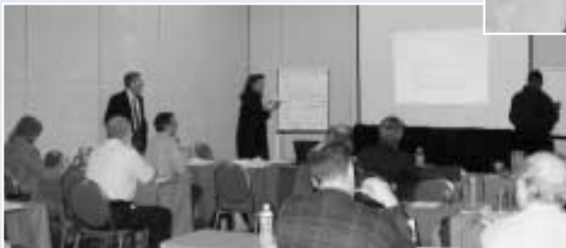
◀ ICSQ attendees hard at work!